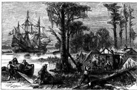
ARRIVAL AT JAMESTOWN.

More than a decade before the Pilgrims set sail, 105 young men - many poor seeking their fortune, some wealthy seeking adventure - tried their own jointstock venture, and sailed from England on three little boats. They planted themselves in the Virginia wilderness on a river they named after their own King James, and formed a fledgling colony they called Jamestown.