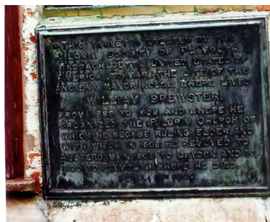
Plaque on the wall of the manor house