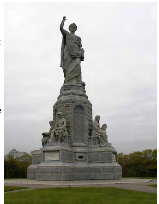
Forefathers Monument, Plymouth, MA

Finally, while Pilgrims and Puritans shared much in common in terms of religious belief, they had some stark differences as well. The Puritans got their name from their desire to “purify” the Church of England of Catholic holidays, ceremonies and other trappings that could not be found in Scripture. The Pilgrims certainly agreed that the Church of England had too many “Romish” influences, but they went still further, saying that the King's Church was beyond repair, and they considered the Leyden and Plymouth churches to be separate from it. In an era when state religions were the norm, this made the Pilgrims seem, to their fellow Englishmen, strange at best, “mongrel Dutch” to others, and untrustworthy expatriates at worst. The term “separatist” was insulting, and was also occasionally used. Perhaps most importantly, the Puritans believed in state religion, while the Pilgrims allowed much more religious toleration and less influence by the church over the civil government. So we should, I think, take great comfort that out of these “small beginnings” (Gov. Bradford's term), meaning the Pilgrims' Plymouth colony, the enduring example of religious liberty was established.