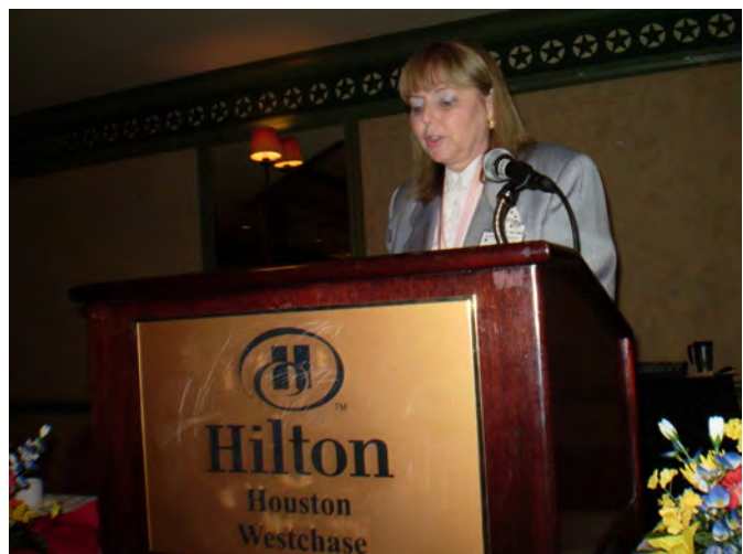
Governor General Judith Swan addresses the Annual Banquet