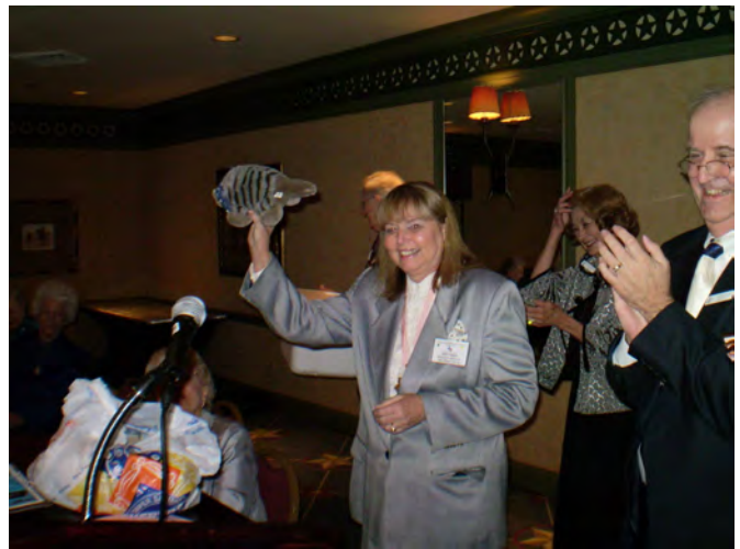
Governor General Judith Swan displays the gift presented by the Houston Colony