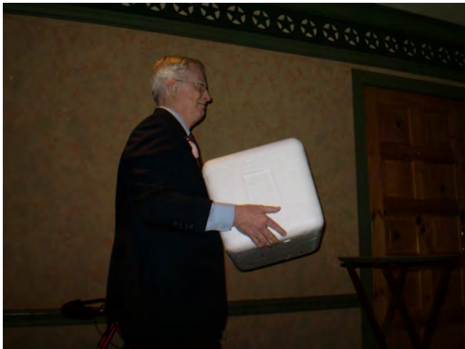
What kind of live animal is in that box?